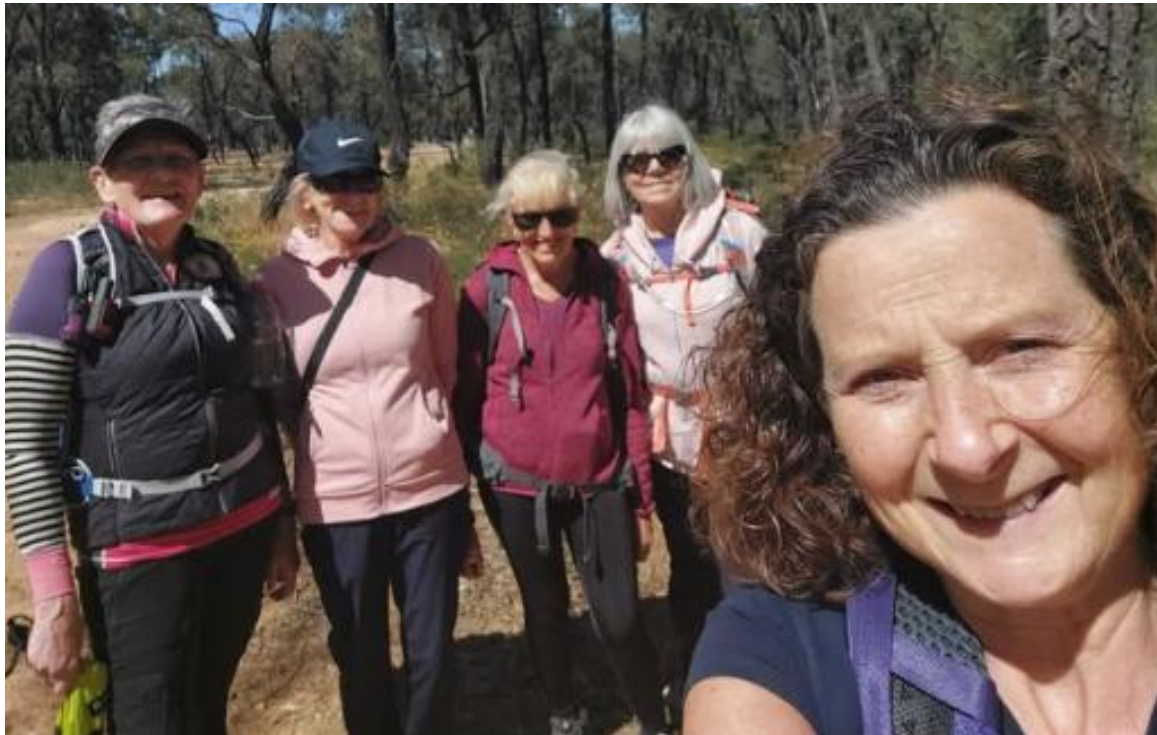
Lightning Hill Walk on 12th November