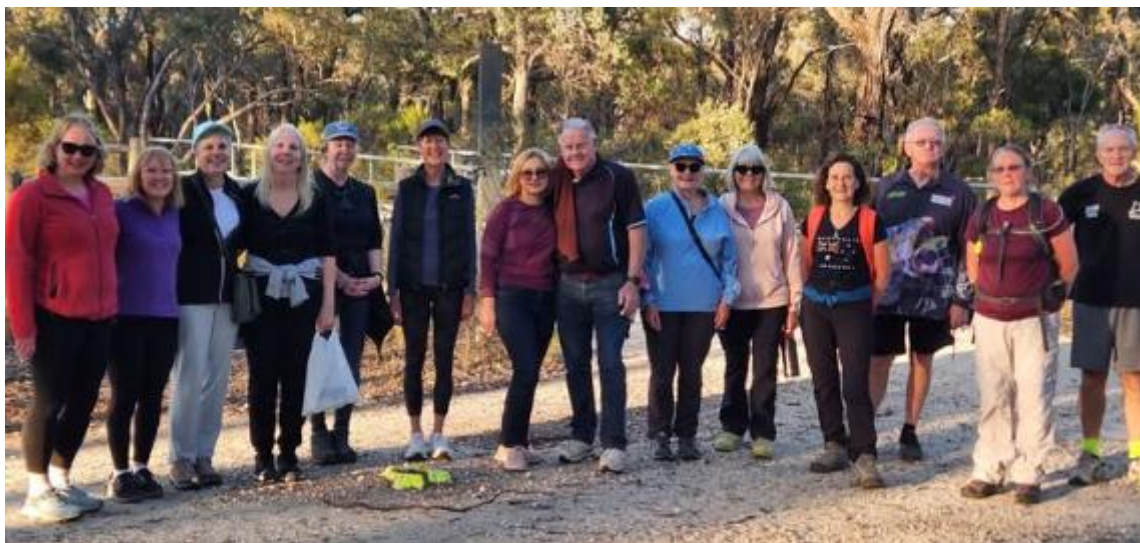
Crusoe Reservoir Twilight Walkers

① $10-$15 ② $30 ③ $45 ④ $60 ⑤ $75 ⑥ $90 ⑦ $105 ⑧ $120 ⑨ $135 ⑩ $150