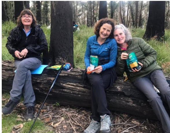
Beeripmo Track break

Bendigo Bushwalking and Outdoor Club Inc. November 2025